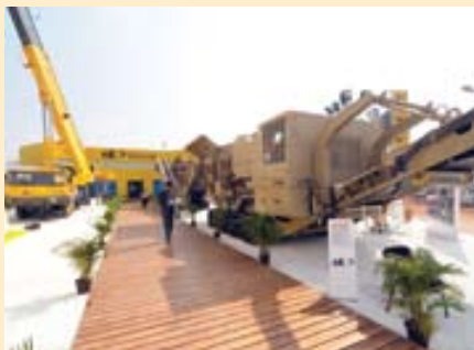
Stall with machines