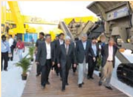
Gracing TIL Stall - Azim Premji, Chairman Wipro