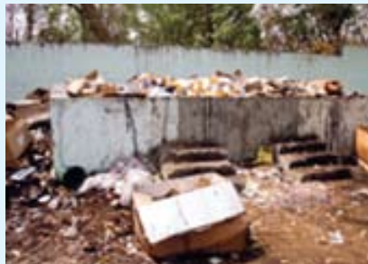
Customer passes by garbage to enter office