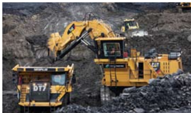
Hydraulic Mining Shovel