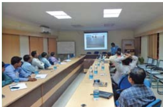
5s training underway

making tools and equipment easily accessible, keeping work areas neat and tidy, establishing the optimal workflow and standardizing operational procedures to ensure greater flexibility in the system.