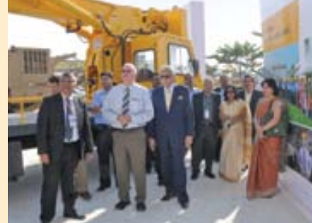
Senior officials at the product launch area