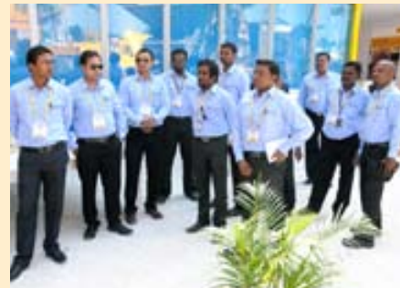
Show workers - ready to receive customers