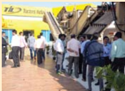
Open for business