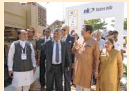
Minister Oscar Fernandes visits our stall