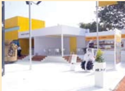
Glimpse of after market section