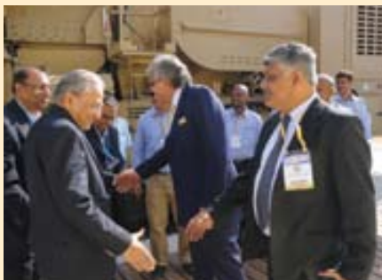
Meeting and Greeting