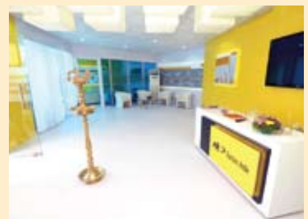
TIL stall - interior