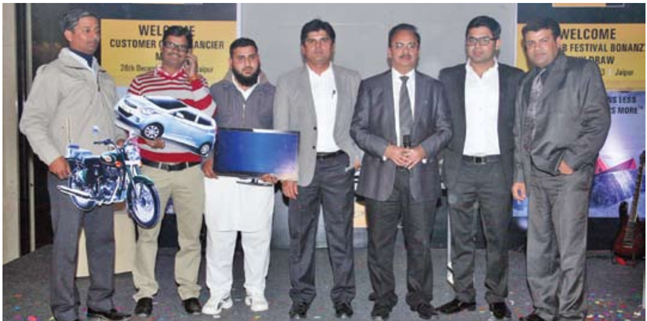
Prize winners with Caterpillar & TIPL officials

Through these various customer centric actions, TIPL plans to further strengthen its enduring relationship with customers that will continue long after the sale.