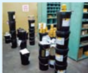
Parts seem lost in a pile - delay in delivery