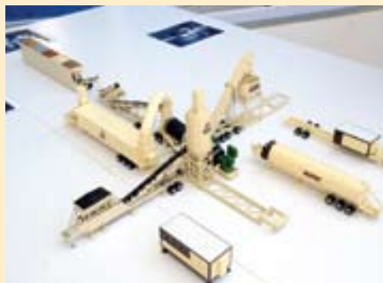
Scale model - HMAP