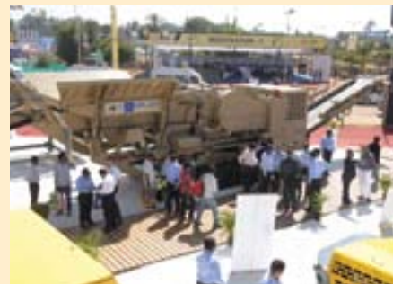
Aerial view of stall