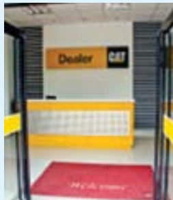
Nobody at the reception to receive customers