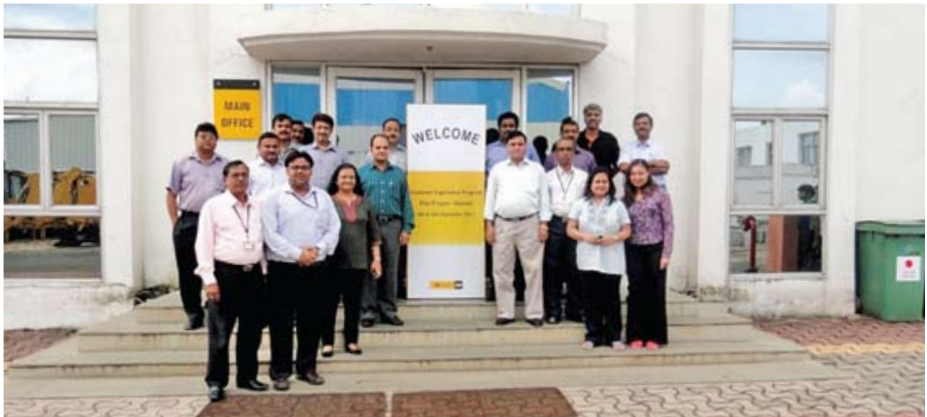
Caterpillar & TIPL CE team at Asansol

As pilot, TIPL chose Asansol under Territory East having substantial revenue from machine, parts and service sales; strategically located in the mining belt and catering to both construction and mining customers. The facility also has machine yard, parts warehouse, CRC and training center and a rental store, with regular customer footfalls for parts, new machines, workshop repair as well as for rental & used machines.