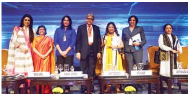
With eminent panelists at the CII AGM, Delhi