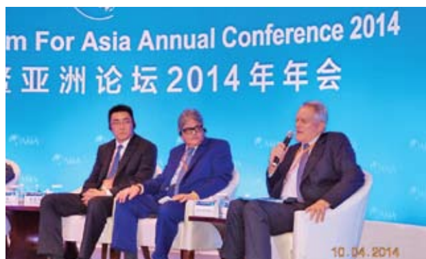
At the panel discussion in Beijing