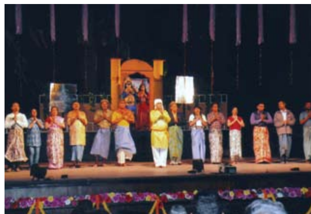
Participants of 'Shonimangal'

All in all, it was an Evening to Remember.