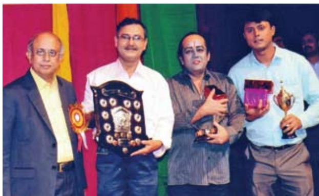
Proud Winners with Club President