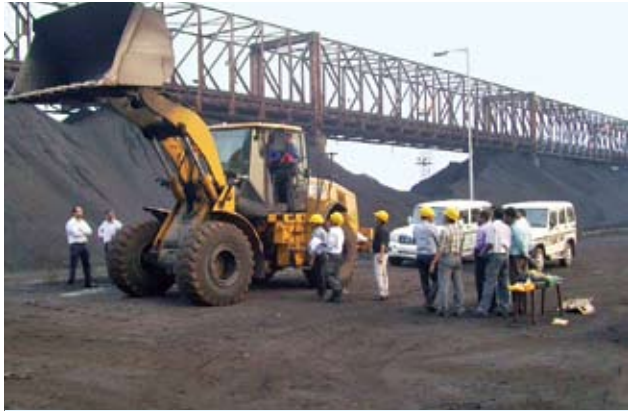
EM CM workshop- practical training

A second EM CM workshop was conducted in Jharsuguda at the site of our customer VFPL-ASIJV on