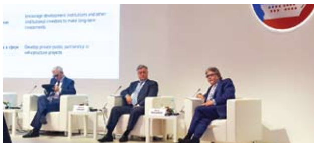
Global CEOs Summit, SPIEF 2014