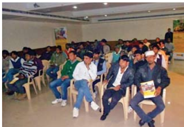
A glimpse of the two Meets