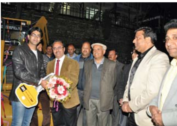
A glimpse of the high moments captured...