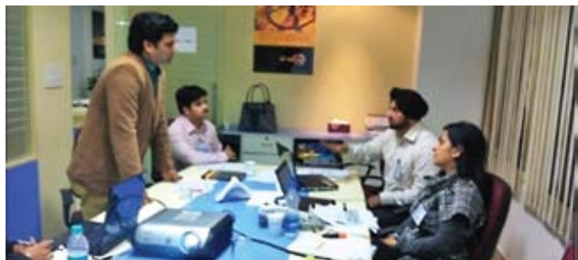
BCP Sales Leaders training in progress

through an interesting combination of Role Plays, Case Studies and Behavioral Interviews.