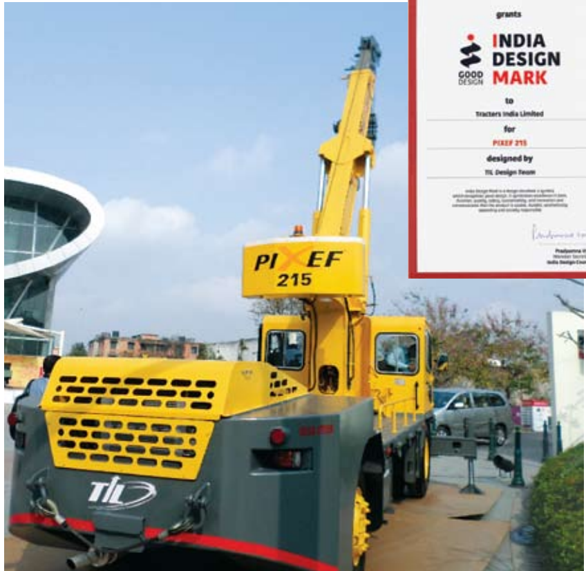
PIXEF standing tall

Following its successful launch at Excon 2013, PIXEF™ 215 – TIL's micro-processor enabled 'smart' and 'safe' new entrant in the 15-tonne hydraulic crane category – has been awarded The India Design Mark for its unmatched concept and design. The award symbolizes product excellence in aesthetics, function, quality, safety, innovation and sustainability.