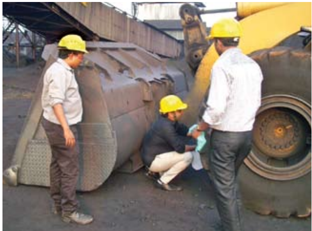
Workshop in progress- machine assessment

similar lines. In both instances, our customers were highly appreciative of the EM Solutions strategy and accepted TIPL's recommendations on their fleet inspections.