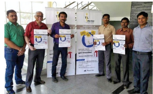
Idea Box launch at TIL Kharagpur

An interesting internal campaign – called the TIL Idea Box – is currently on at TIL, with Taratolla (HO), Kamarhatty Works, Kharagpur Works, Delhi, Chennai and Mumbai as the prime participating locations among others. The TIL Idea Box offers a platform for all TIL employees to make a meaningful impact on the Company's growth by contributing new and innovative ideas for improvement and business success of the Company. With the campaign being slated to continue till the 31st of March 2017, accepted ideas will be assessed on the basis of their potential impact and ease of implementation, and the best ideas rewarded on a weekly and monthly basis.