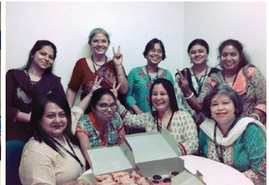
Women Power at TIL