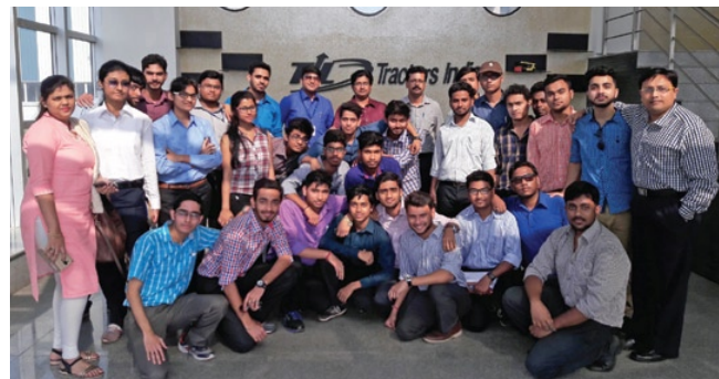
Students of RCCIIT Kolkata at TIL Kharagpur