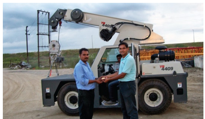
Posing with the Yard Boss at JSPL Angul, Odisha

It is a matter of great pride for TIL to have received a Performance Certificate from Jindal Steel & Power Limited (JSPL) for the Grove Yard Boss, model YB4409, Industrial Crane deployed at the Angul (Odisha) complex of JSPL. Since its commissioning in September 2013, the compact and reliable crane has been consistent in its trouble-free operations and performance. JSPL has also extended their appreciation for TIL's exemplary after-sales service.