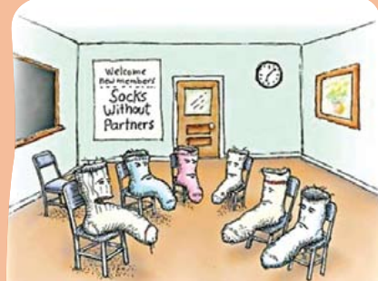
"The last thing I remember is being thrown into the dryer."