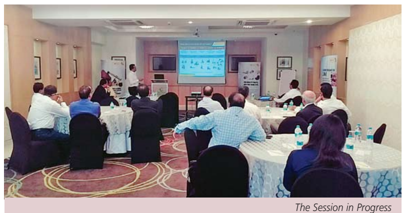
The Session in Progress