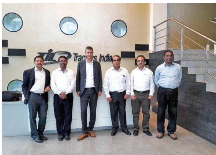
Hyster Delegates with Senior TIL Executives at TIL Kharagpur