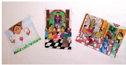
Winning entries in the sit-and-draw contest