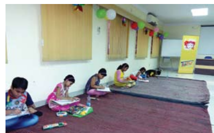
Sit & Draw Competition at TIL Kamarhatty