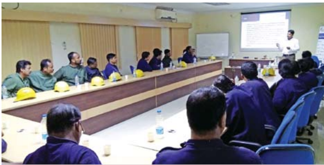
Safety Training for Fabricators cum Welders at TIL Kamarhatty

Safety Training Programs were organized by TIL Kamarhatty for fabricators, welders, crane operators and helpers in association with Cutting Systems India (P) Ltd and SLINGSET in the months of November and December respectively.