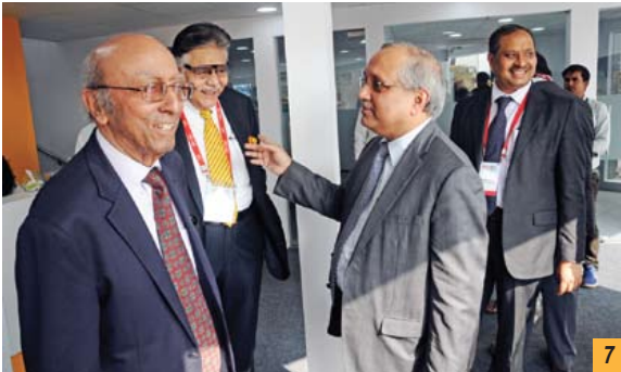
Photo gallery continued...