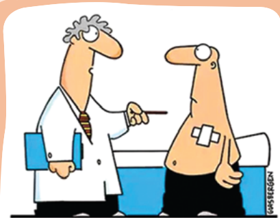
"It's a pacemaker for your heart. Plus, you can download apps for your liver, kidneys, lungs, and pancreas!"