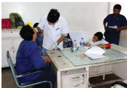
Dental Camp at TIL Kamarhatty

In December, a free eye camp for employees at the Kamarhatty factory was organised in association with TITAN EYE PLUS.