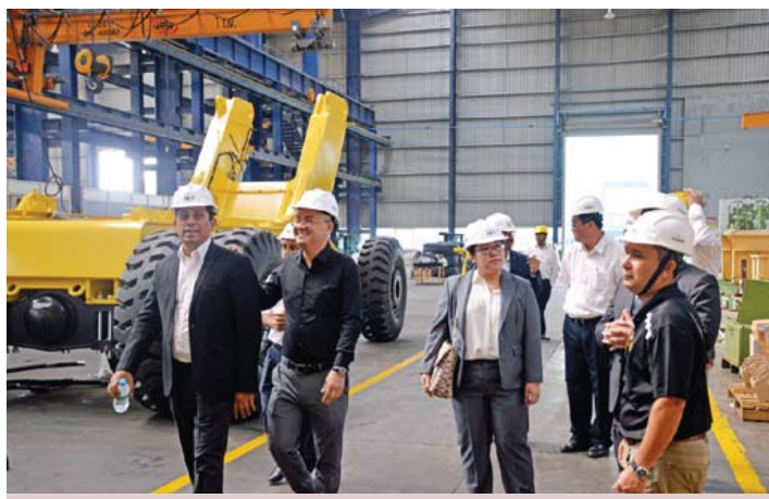
Hyster Delegates at TIL Kharagpur