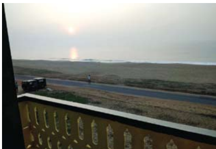
Sunrise from the Balcony

Bookings are pouring in thick and fast. Make sure you plan your holiday calendar well in advance!