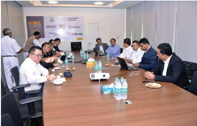
Discussions with Hyster delegates at TIL Kharagpur