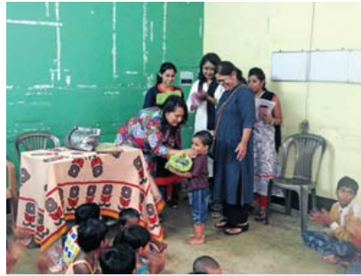
At the Kolkata school run by Mukti

On the occasion of the Durga Puja, TIL joined hands with the Mukti Foundation, a prominent NGO involved with rehabilitation and mainstreaming - by way of sheltering, educational guidance, vocational training,