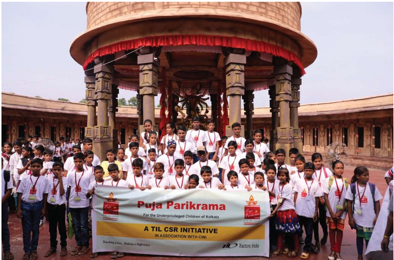
Puja Parikrama 2017

On the occasion of Panchami, TIL Limited, in association with Child In Need Institute (CINI), organized a 'Puja Parikrama' for a group of underprivileged and marginalized children of Kolkata, who were taken on a tour of select Puja pandals in the city. This was the sixth consecutive year that TIL undertook this activity as part of their CSR initiative. The children, numbering one hundred and aged between six and fourteen years, were accompanied by a number of volunteers from CINI and members of the TIL CSR team. The young ones were provided with breakfast and snacks, and were treated to a special lunch at the end of the tour. They were also presented with t-shirts and gifts. Hailing from shelter homes run by CINI, the children had a fun time and look forward to the same time next year. While the organizers acknowledge that altering the destinies of these unfortunate children will be no easy task, they sincerely hope that such programs as the Puja Parikrama will go some distance in instilling in their unblemished hearts faith and optimism for a better tomorrow.