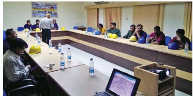
Safety Training for Crane Operators at TIL Kamarhatty