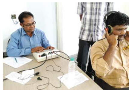
Medical Check-up at TIL Kharagpur