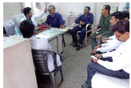
Eye Camp at TIL Kamarhatty