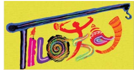
The TILOTSAV Icon