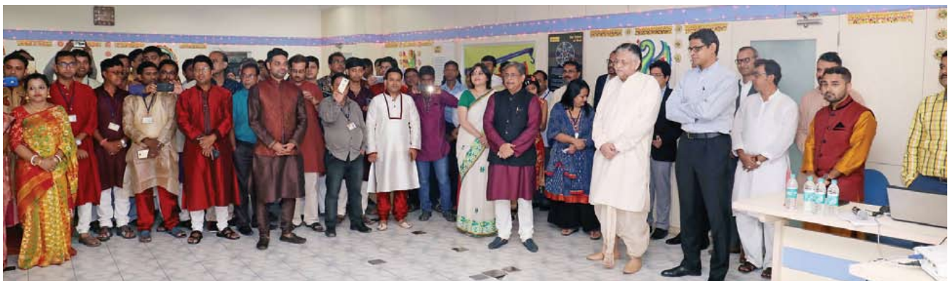
Team TIL at the Taratolla HO