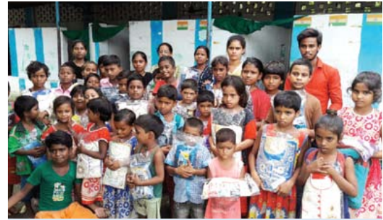
At the Chengail school run by Mukti

and computer literacy - of the destitute, substance - addicted and other marginalized members of our society since 2002. TIL has been supporting quite a few of their projects over the years. This time TIL gifted new clothing to 100 children - aged between 5 to 15 years, some younger - studying in two non-formal schools run by Mukti Foundation, one in Kolkata and the other at Chengail. These non-formal school ensure the right to education to a large number of children dwelling on streets, railway platforms, or involved in any form of child labor, having no access to schooling due to abject poverty and ignorance. A noble endeavor on the part of TIL and Mukti and quite a rare pleasure to see young and hopeful faces lighting up with joy as they received their gifts.