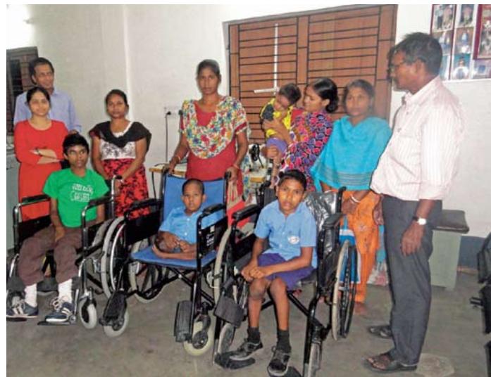
At the RCFC Hospital in Kolkata

TIL recently sponsored orthopaedic aids (wheelchairs and walking braces) to 4 children, aged between 6 to 14 years, in association with Rehabilitation Centres for Children (RCFC), a non-government, non-profit and voluntary organization dedicated to providing free orthopaedic care to specially-abled underprivileged children since 1973. These are children hailing from impoverished families, mostly agricultural subsistence workers hailing from rural areas. In the absence of the free service provided by the likes of RCFC, these families would have neither the means nor the resources to get their unfortunate children treated, thus relegating them to lives of dependency and misery. In the last 44 years, RCFC has reached out to more than 65000 children from West Bengal and its neighbouring states and even from