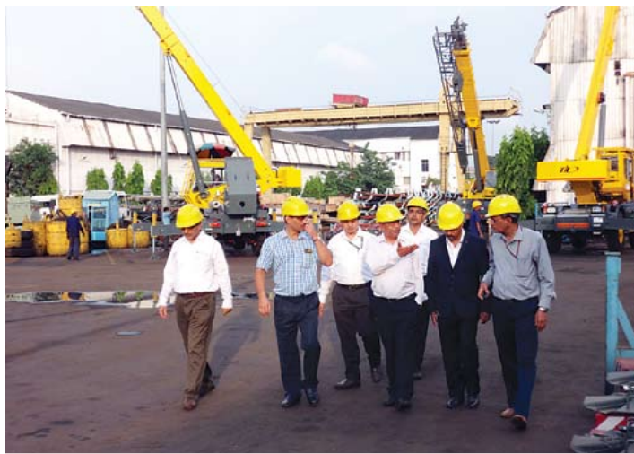
R&DE and NSTL Delegates at TIL Kamarhatty