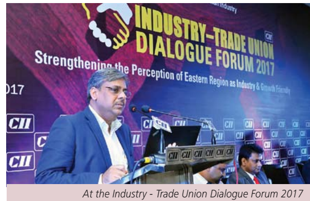
At the Industry - Trade Union Dialogue Forum 2017

Auto-rickshaw service is available to take visitors to the Swargadwar area, Jagannath Mandir or any other place of their choice. But above all, the standout feature of the property is its proximity to the sea. Located just across the road facing the house, a mere 50 meters away from the main door, the beach is clean, quiet and very private.