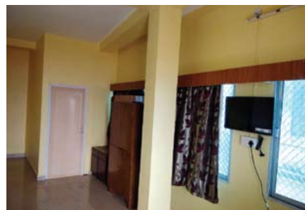
Fully furnished Rooms