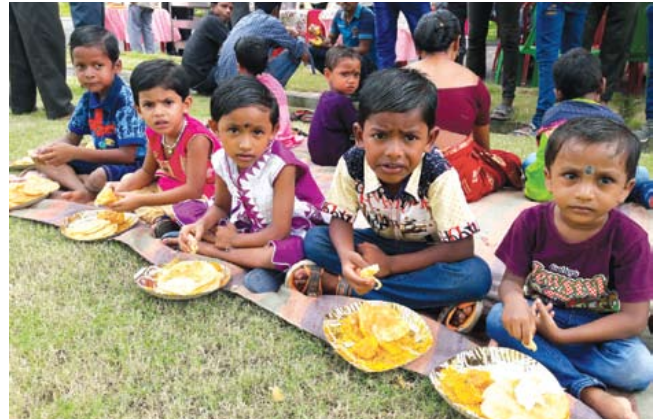
Children were treated to a feast on Vishwakarma Puja at TIL Kharagpur