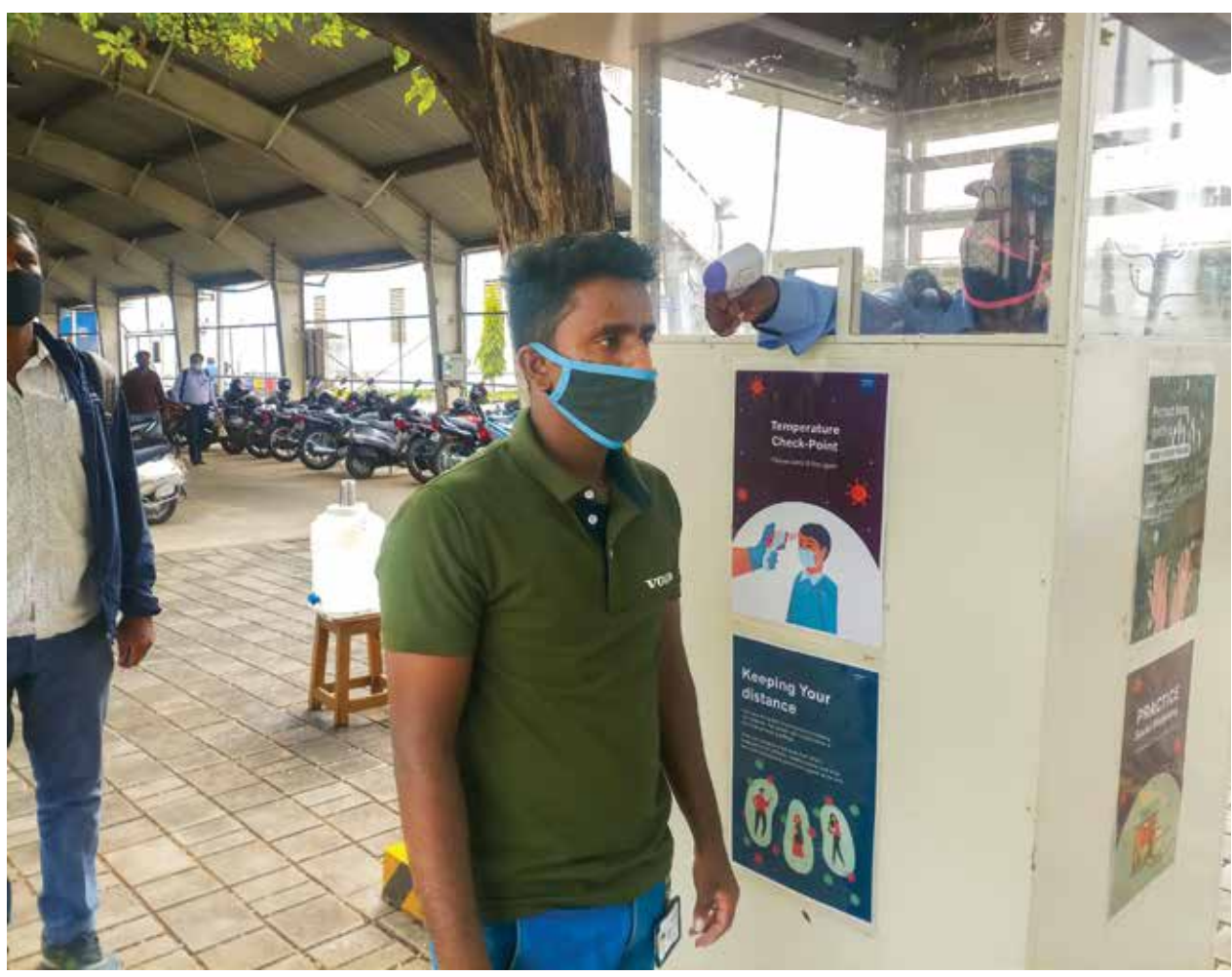
▲ Many companies went the extra mile to safeguard workers and the neighbouring areas.