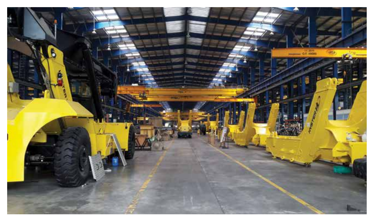
▲ TIL took plenty of precautions before restarting its Kharagpur factory.