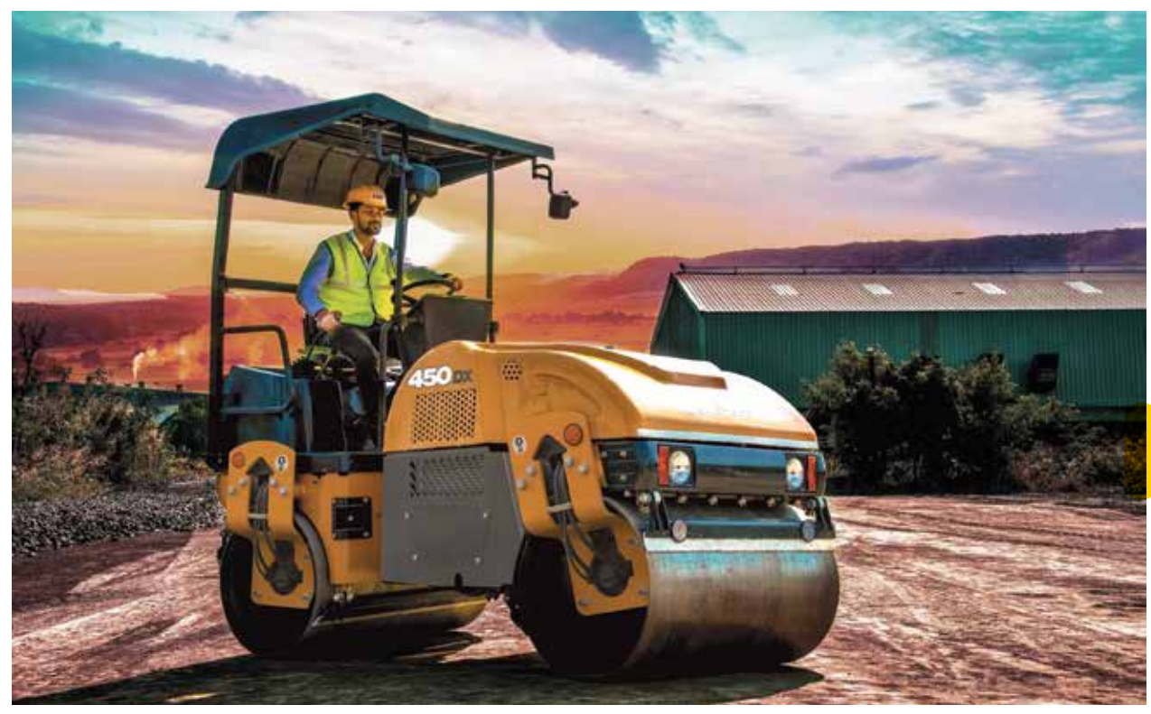
▲ CASE Construction has some advanced machines for infrastructure projects.