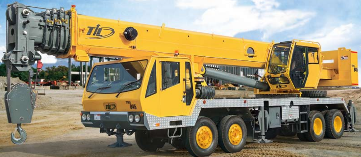
HYDRAULIC TRUCK CRANE